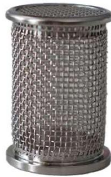
20 Mesh Basket