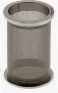
100 Mesh Basket