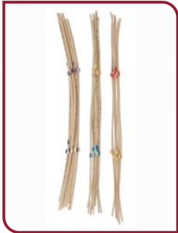
Pharmed Tube for Ismatech Pump

ARROW PHARMATECH EXPERTISE . SERVICE . INTEGRITY