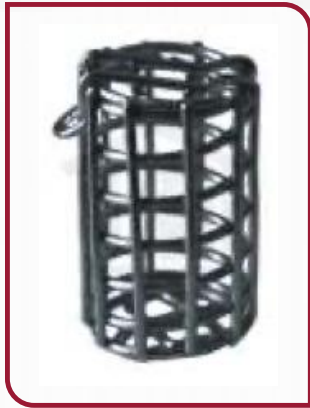
Japanese Sinker (Figure 2a Ref USP Above)

ARROW PHARMATECH EXPERTISE . SERVICE . INTEGRITY