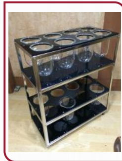
Bowl Stand 2