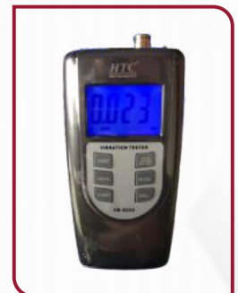
HTC Vibration Meter