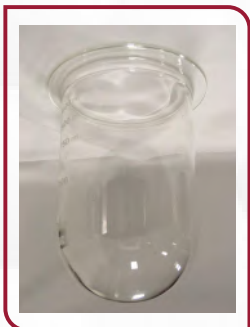
1 Liter Clear