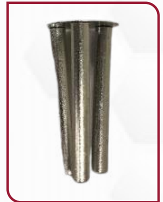
3 Prong Sinker