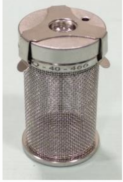
40 Mesh Basket