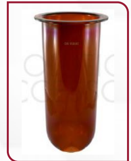
2000 ml Amber Vessel