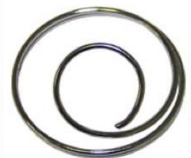
Basket Film Sinkers