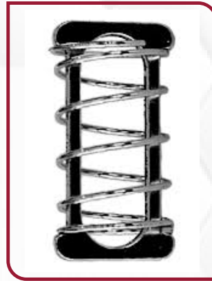
Capsule Sinker STD