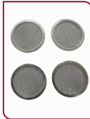
Paddle Over Disc