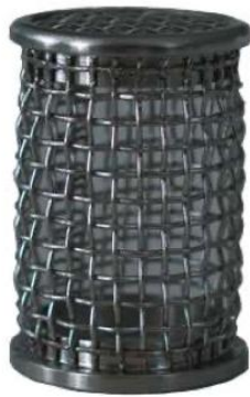
10 Mesh Basket