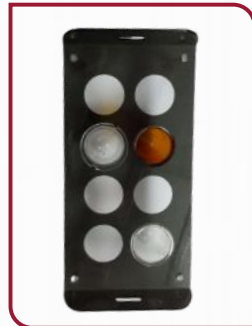
Bowl Stand 1