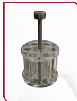
DT Basket Assembly