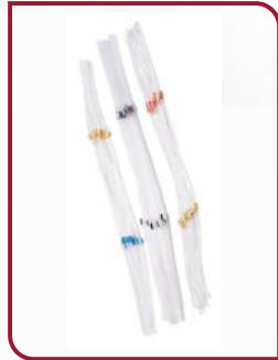
Tygon Tube for Ismatech Pump