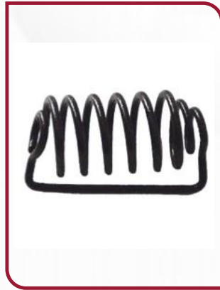
Sinker or Coil Sinker