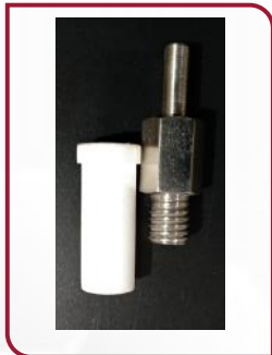
10 Micron Filter With Holder