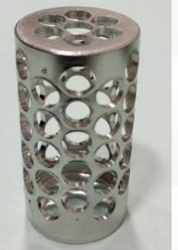
Alfuzosin Tablet Holder