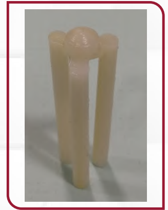
3 Prong Sinker