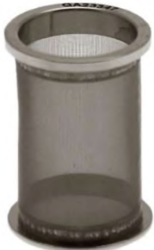
150 Mesh Basket