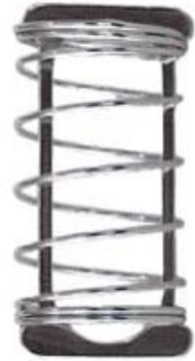
'Sotax Style' Spiral Sinkers